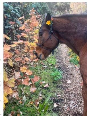
Magic Ben browsing pasture under the grapevines

Our farm can be a great location for school visits, private tours, group events, picnics, and parties. Guided horse sessions are also available. We ask you reserve these special services at least four days in advance.